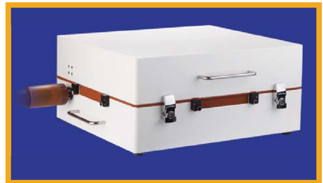
Compact Chamber Clamshell Model

Note: See Compact Chamber Clamshell data sheet