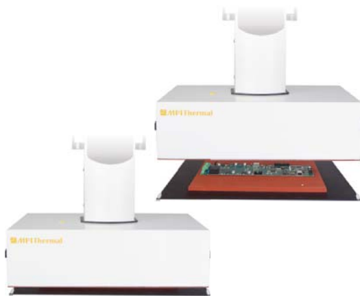
Hood Compact Chamber up/down on test component