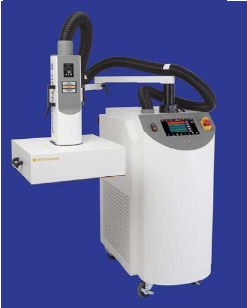
TA-5000A with Compact Chamber Hood